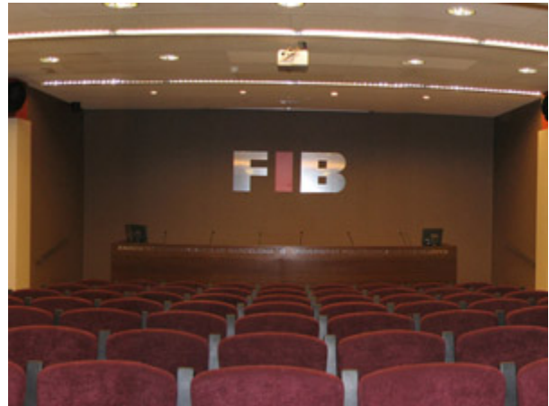
Sala actes FIB