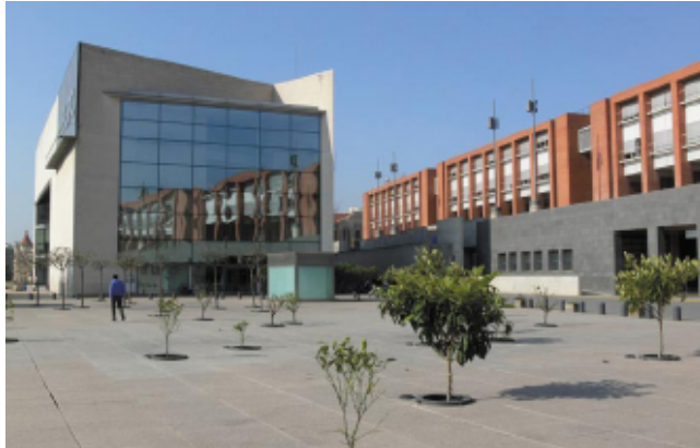
Campus Nord Library Square