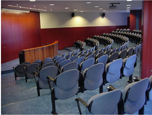
Sala actes Vertex UPC

Here are some impressions of the campus area and conference halls: