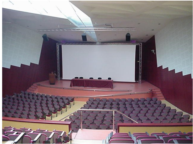
Auditori Vertex UPC