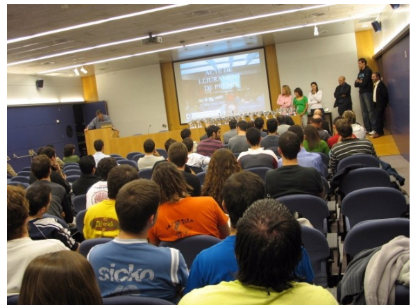
Sala Master Campus Nord UPC