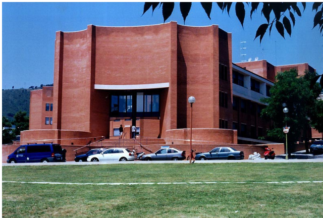
Vertex Building UPC