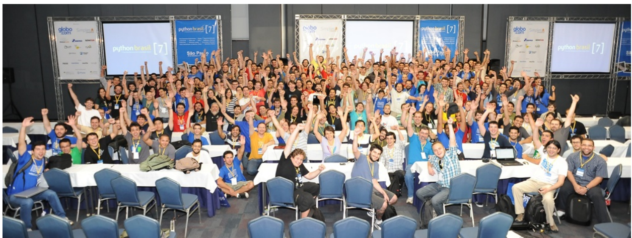
PythonBrasil[7] and Plone Symposium South America 2011 Attendees