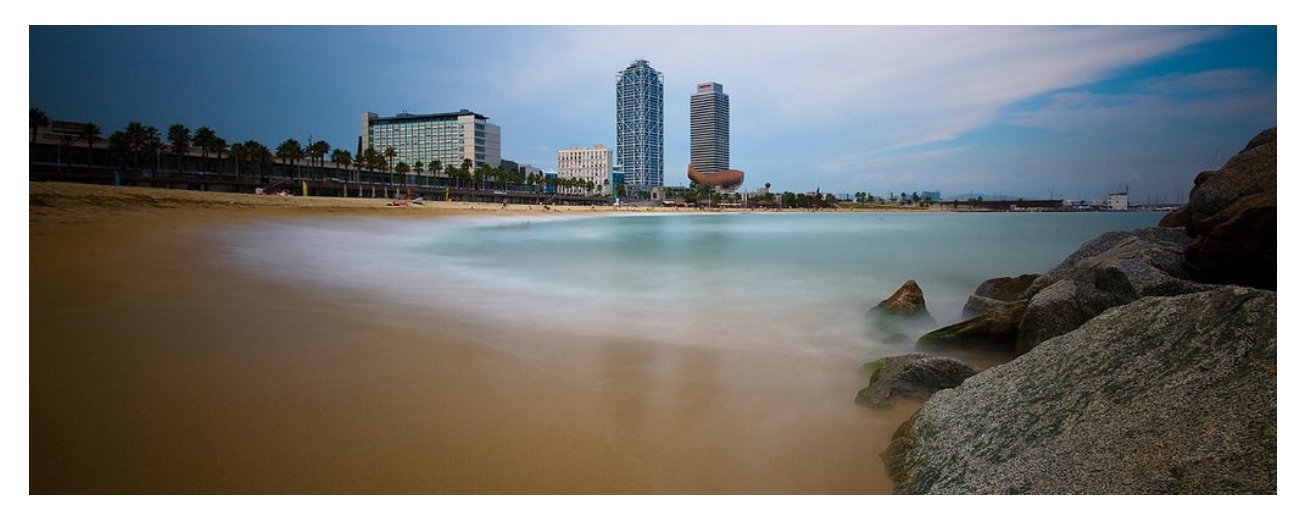
Sprints - Saturday October 21, Sunday October 22, 2017

Some portion of the conference will be devoted to the successful "Open Space" discussions with topics proposed by the attendees.